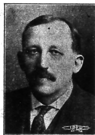
JAMES H. MAURER, President Pennsylvania Federation of Labor